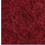
Vintage Red - 99 (VRD)