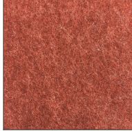
Autumn Ember - 90 (ANE)