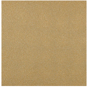
Jazz Gold - 29