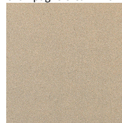
Champagne Cream - 26