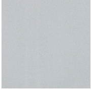
Sparkling Silver - 01