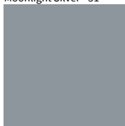
Moonlight Silver - 31