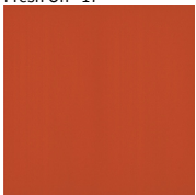
Fresh Oh - 17