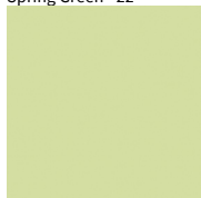
Spring Green - 22