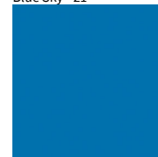
Blue Sky - 21