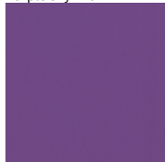
Purple Sky - 16