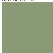
Olive Breeze - 30