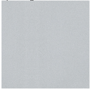
Sparkling Silver - 01