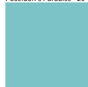
Poseidon's Paradise - 20