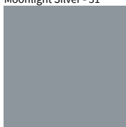
Moonlight Silver - 31