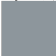
Moonlight Silver - 31 (MOS)