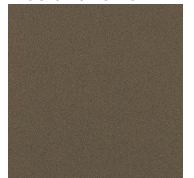
Ancient Bronze - 28