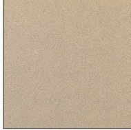
Champagne Cream - 26 (CHC)