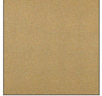
Jazz Gold - 29 (JAG)