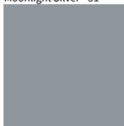
Moonlight Silver - 31