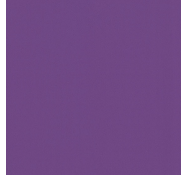
Purple Sky - 16