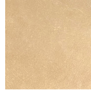
Sunrise - SNR