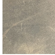
Midnight - MNT