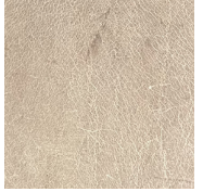
Sunset - SNS