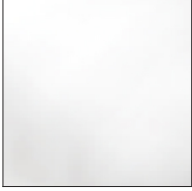
Embossed White - EWH