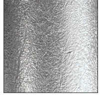
Silver Leaf - SLF