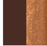
Coffee / Copper Leaf - CCL