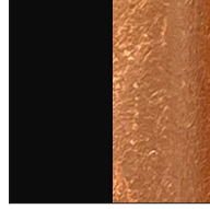
Embossed Black/Copper Leaf - EBC