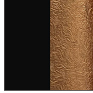
Embossed Black/Bronze Leaf - EBB