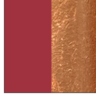
Purple Red / Copper Leaf - PRC