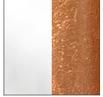
Embossed White/Copper Leaf - EWC