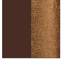
Coffee / Bronze Leaf - CBL