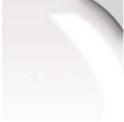
Transparent - TRA