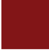
Red - RED