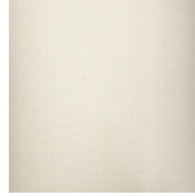
Champagne - CHA