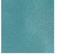
Turquoise - TUR