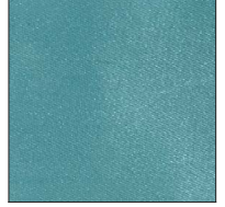
Turquoise - TUR