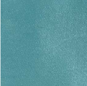
Turquoise - TUR