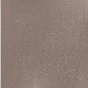
Taupe - TAU