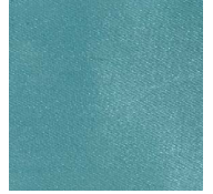
Turquoise - TUR