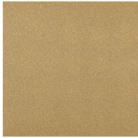
Jazz Gold - 29