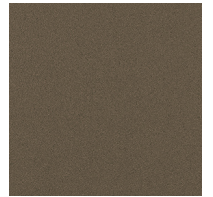
Ancient Bronze - 28