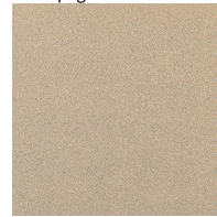
Champagne Cream - 26