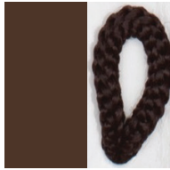
MARRON Pant. 476C 187