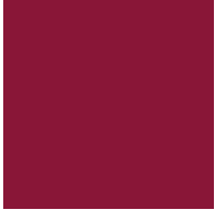
Maroon - MRN