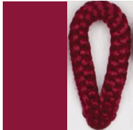
MAROON - MRN Pant. 1955C 224