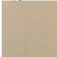
Champagne Cream - 26