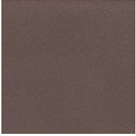
Rusty Rush - 10