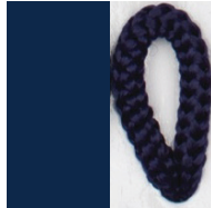
PACIFIC Pant. 2767C 68