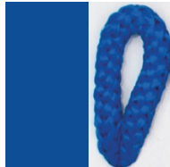
AZUL ELECTRICO Pant. 2945 49