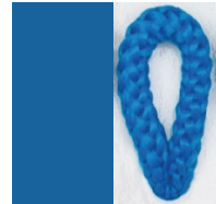
TEJANO Pant. 3015C 55