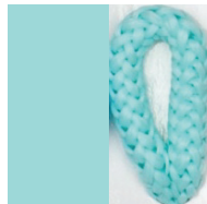
LAGO Pant. 324C 313