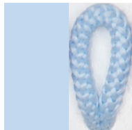
ESCARCHA Pant. 2707C 60