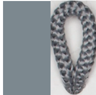
DELHIN Pant. 430C 126