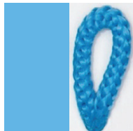
BLAVINA Pant. 2915C 59