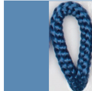
ALITALIA Pant. 646C 125