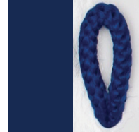
MEDAS Pant. 295C 24