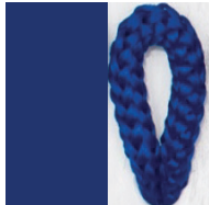
AZUL ROYAL Pant. 288C 1075