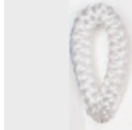
CRYSTAL Pant. GLASS 75