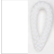
S - WHITE- WHI Pant. WHITE 71