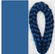
S - BLUE (INDIGO) Pant. 653C 61