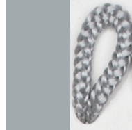
ALPACA Pant. 429C 1401