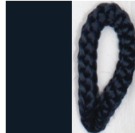
NOCTURNO Pant. 7547C 66