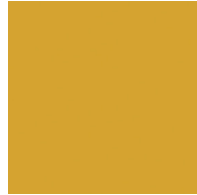
Golden Heart - 24