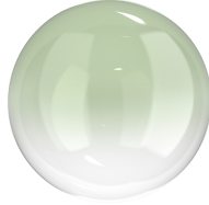
Green Nuanced - GNN