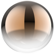
Bronze Nuanced - BZN