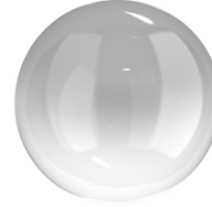
Tobacco Nuanced - TON