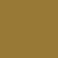
Black Brass - BBR