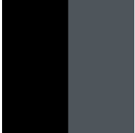
Black/Anthracite - BAN