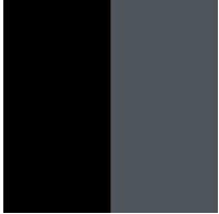
Black/Gold Leaf - BGL