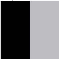
Black/Aluminium - BKA