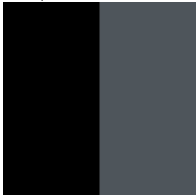
Black/Anthracite - BAN