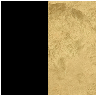
Black/Gold Leaf - BGL