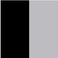
Black/Anthracite - BAN