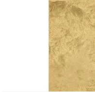
White/Gold Leaf - WGF