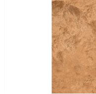
White/Copper Leaf - WCL