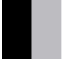
Black/Anthracite - BAN