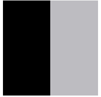
Black/Anthracite - BAN