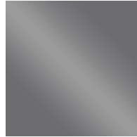
Anthracite Gray Lacquer/Gold - AGG