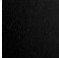
Chrome - CHR