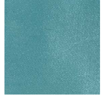
Turquoise - TUR