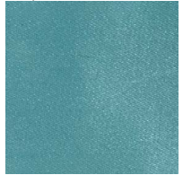
Turquoise - TUR