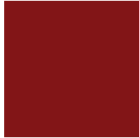
Red - RED