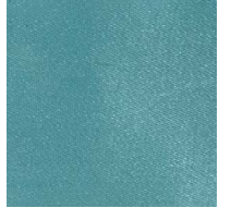
Turquoise - TUR