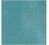
Turquoise - TUR