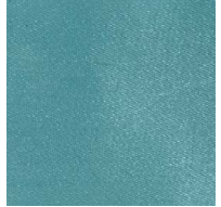
Turquoise - TUR