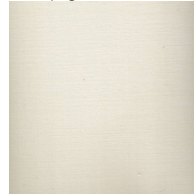
Champagne - CHA