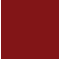
Champagne - CHA