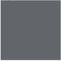
Gray - GRY