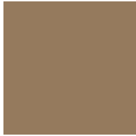
Mocha - MOC