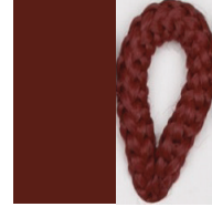
COGNAC - COG Pant. BLACK C 255