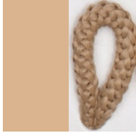
BEIGE - BEI Pant. 727C 196