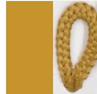
MUSTARD - MUS Pant. 1245C 168