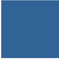
Blue - BLU