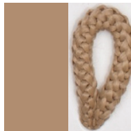
S - BEIGE - BEI Pant. 727C 196