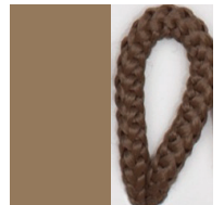
S - MOCHA Pant. 7504C 175