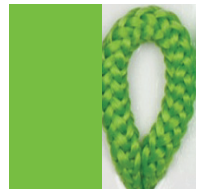
CIRUELA Pant. 368C 104