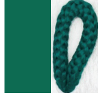
VERDE OSC. Pant. 3298C 358