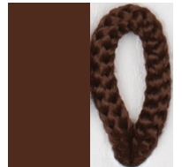
TABACO Pant. 1545C 203