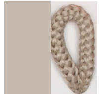
S - STONE - STN Pant. 7528C 1196