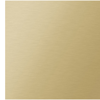
Matte Brass - MBR