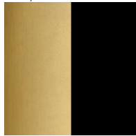
Brass/Black - BBK