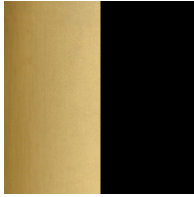
Brass/Black - BBK