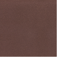
Rusty Angel - 09