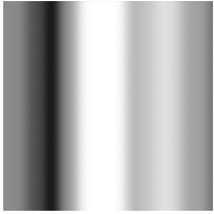
Brass - BRA